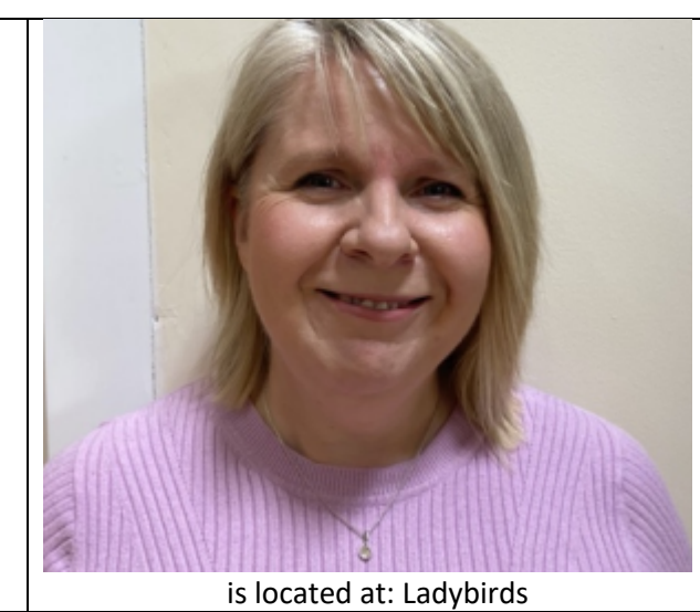
is located at: Ladybirds