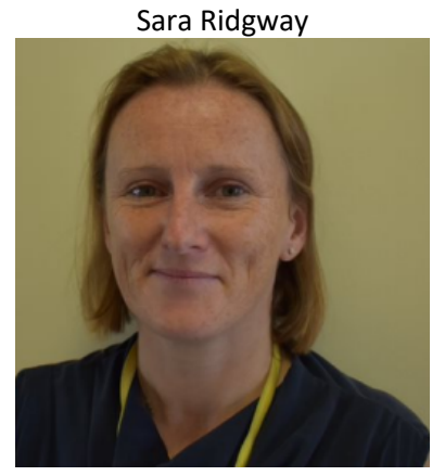
is located at: Deputy Heads Office