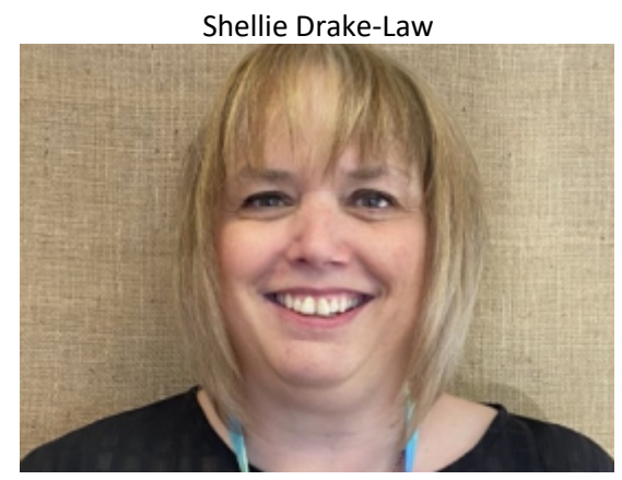
is located at: Ladybirds